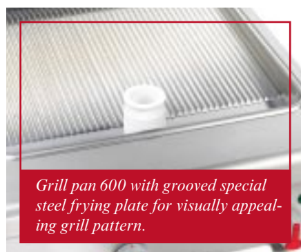
Grill pan 600 with grooved special steel frying plate for visually appealing grill pattern.