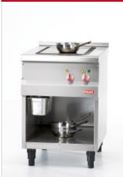
CNS range 600 with open basement