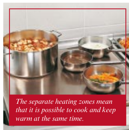
The separate heating zones mean that it is possible to cook and keep warm at the same time.