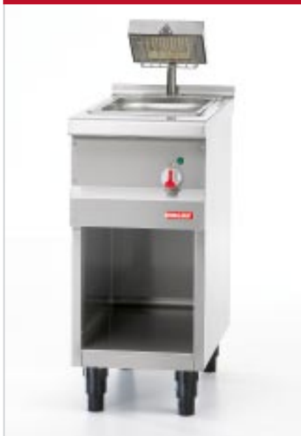
Chip scuttle GN 1/1 with open basement