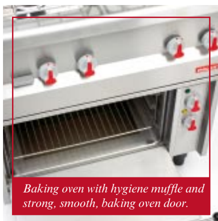
Baking oven with hygiene muffle and strong, smooth, baking oven door.