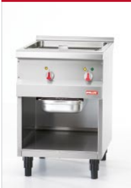
Grill pan 600 with open basement