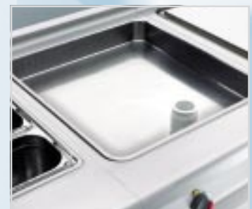
Pan: the highly polished frying surface guarantees equal roasting and cooking results.