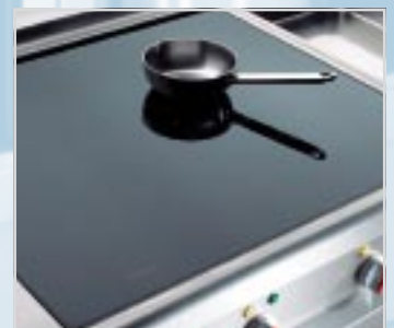
Induction Range: large surface induction for optimum handling of small sauce pans.