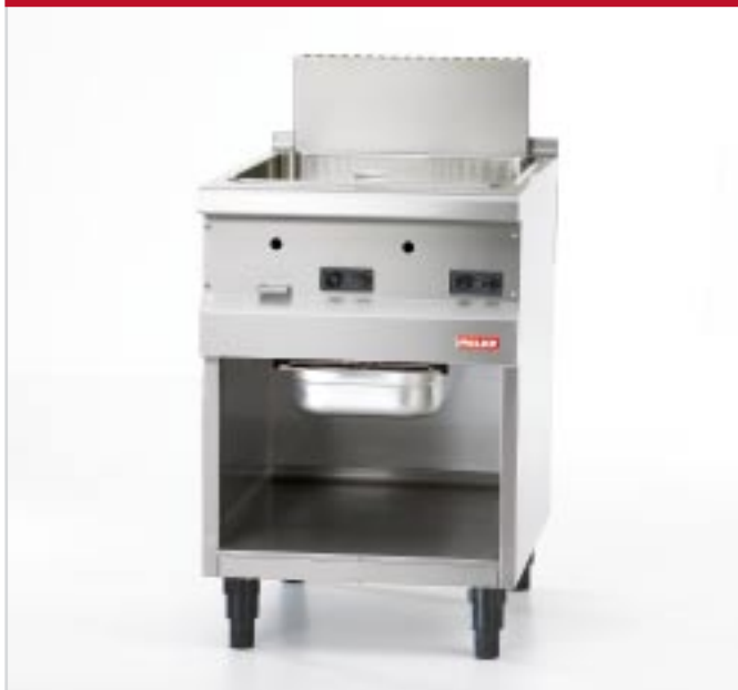
Gas pan 600 with open basement