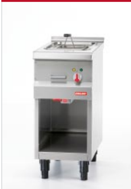
Single pan deep fat fryer with open basement