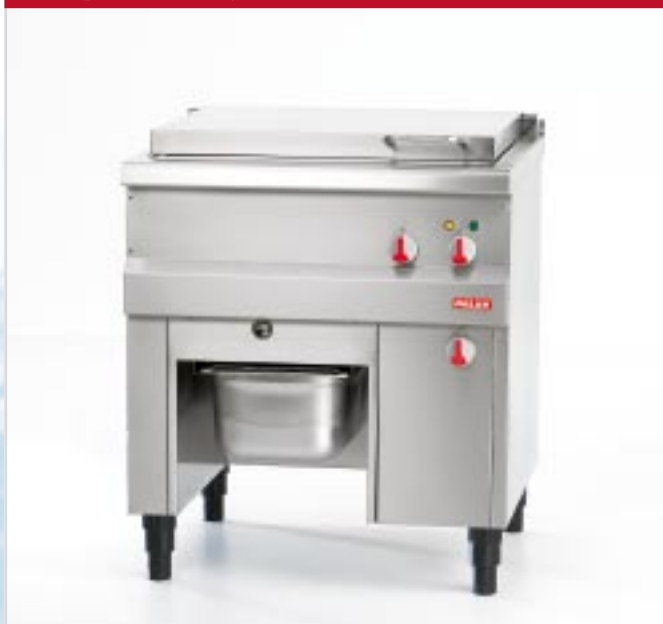
Pan 800 Plus W with open basement for GN 1/1 container