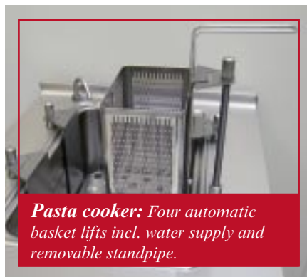
Pasta cooker: Four automatic basket lifts incl. water supply and removable standpipe.