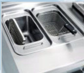
Deep fat fryer: flat tubular heating element swivelling in the pan, easy to clean and safe.