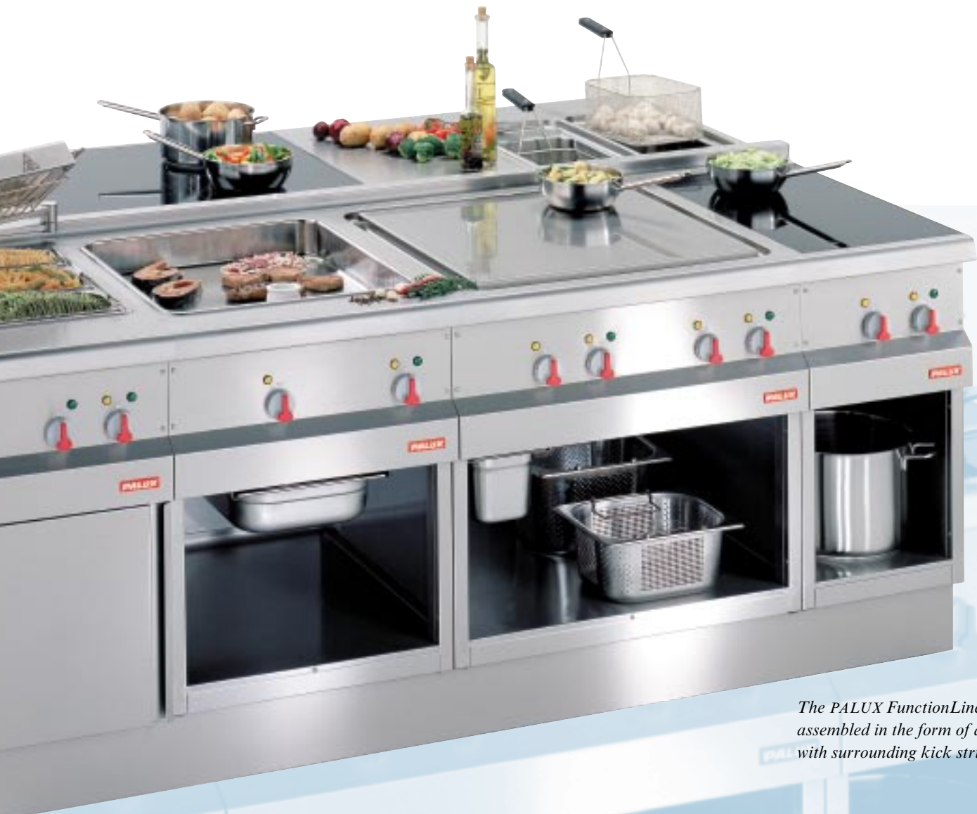
The PALUX FunctionLine assembled in the form of a block with surrounding kick strip.