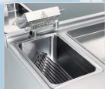
Cooker: swivelling flat tubular heating element for short heating up times and optimum energy transfer.