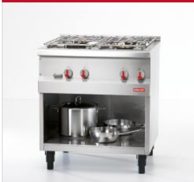
4-burner gas range with open basement