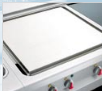
CNS-Range: finely ground CNS surface with U-shaped collector channel with drain.