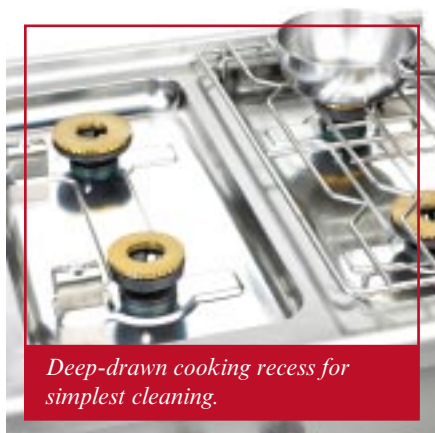
Deep-drawn cooking recess for simplest cleaning.