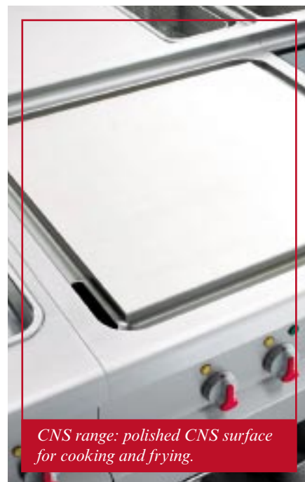
CNS range: polished CNS surface for cooking and frying.