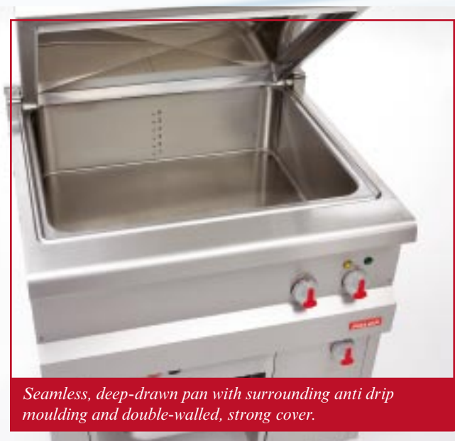
Seamless, deep-drawn pan with surrounding anti drip moulding and double-walled, strong cover.