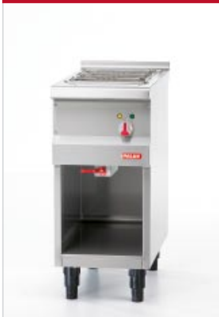
Cooker GN 1/1 with open basement