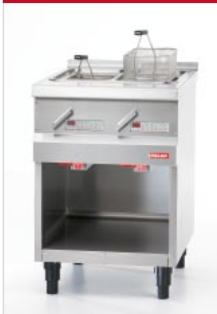
Eco-frit double pan deep fat fryer with open basement